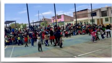
Funds Raised for 15 Passenger Van