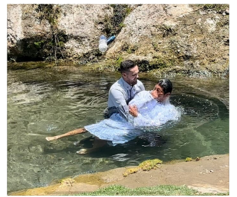
Second Church Plant