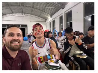
Second Church Plant